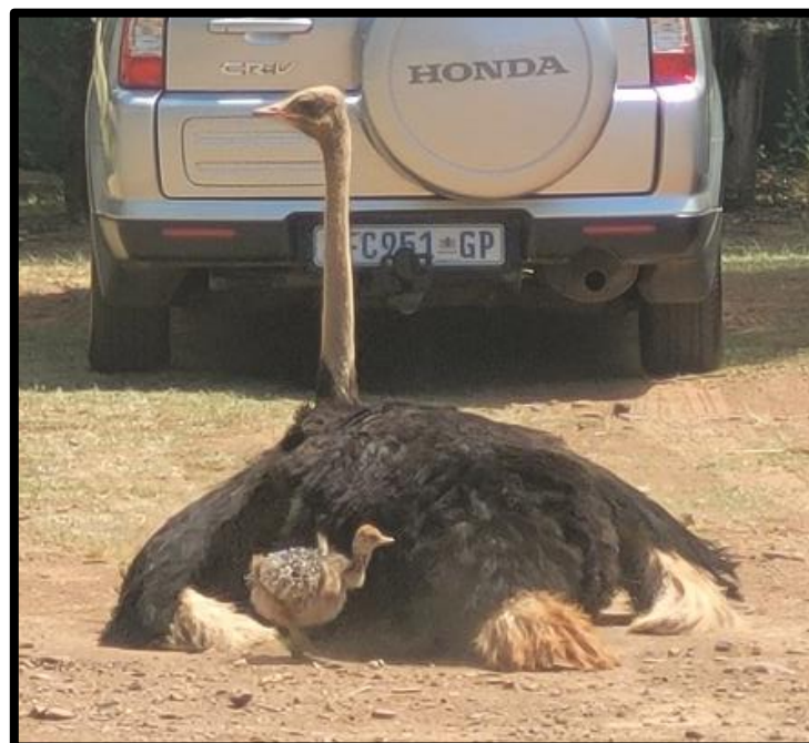
Figure 4: Mr Ostrich and chick

After the introduction of a male ostrich to the Reserve we were extremely pleased to see a successful ostrich chick was born towards the end of last year. He was often sighted with his parents, and we were pleased to see the male appeared to be a very doting father. Unfortunately, we haven't seen the youngster in a while and we fear he may have perished. However, we are excited to see renewed attempts from these birds in the future and we look forward to future successful chicks.