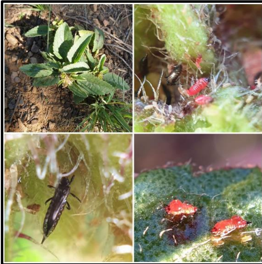
Figure 2: Pompom thrips in the various life stages

We released more Pompom thrips on 14 December 2023. We are happy to report that the thrips is spreading well in the Reserve. These small insects may not kill the plants but it does reduce the flowering and seed load and thus helps slow the spread of this invasive plant, allowing us to have a better chance of eradicating this plant from the Reserve.