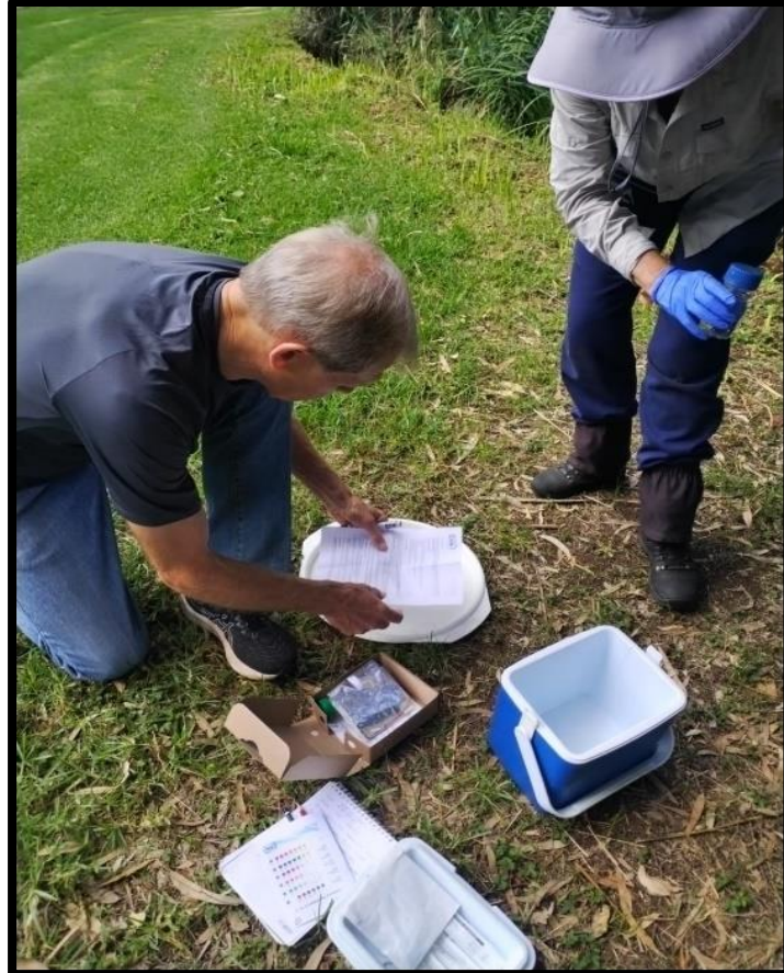
Figure 3: WaterCAN Testing

WaterCAN is kindly continuing with sponsoring water testing kits. We are continuing with the water testing in the reserve on a regular basis. A map of the results is available on www.watercan.org.za/map/ . The results show that the water in the reserve is not safe to drink. We urge members of the community to report any sewage spills on SewerBlockages@tshwane.gov.za .