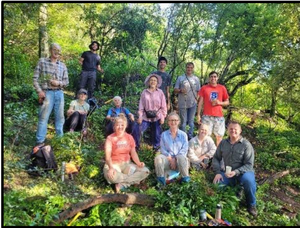
Figure 1: A team of volunteers stops for communal tea, coffee and snacks during a morning of invasive species removal.

We will continue to work every Wednesday morning, the second Saturday of the month and some Sundays. Please look out for our notices on Facebook and from this email address. We welcome any assistance we can get. Come spend the morning with us and experience the Reserve in way you never have before, while contributing to the upkeep of this beautiful green space in your community.